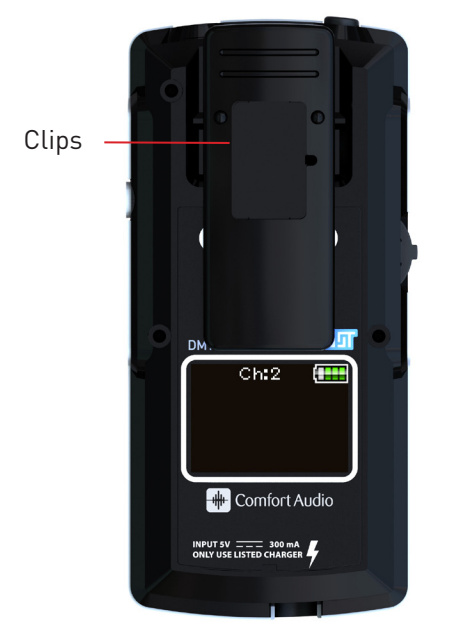
Display Microphone DM10

For other accessories, please visit our website www.comfortaudio.us